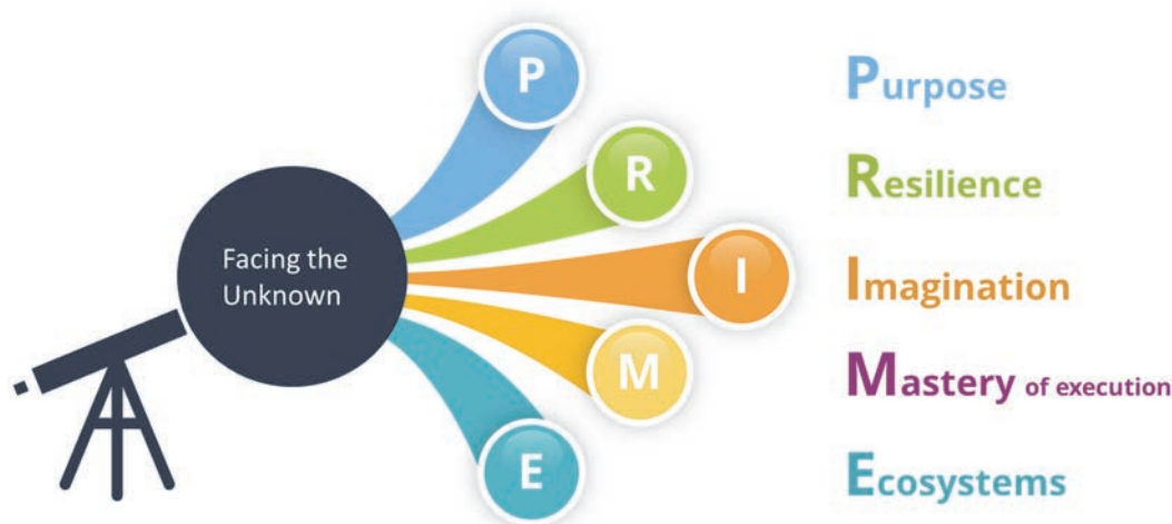
FIGURE 1 The Five Pillars of PRIME

This PRIME framework comprises five pillars — purpose, resilience, imagination, mastery, and ecosystems — that need to be addressed holistically by defining appropriate business priorities within each pillar.